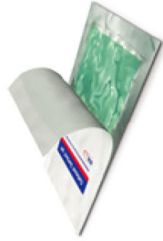
Cutimed® Sorbact® gel*

*Promotes autolytic debridement in sloughy or partially necrotic wounds