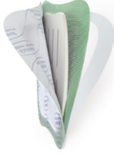
Cutimed® Siltec® Sorbact®