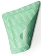
Cutimed® Sorbact® Hydroactive B